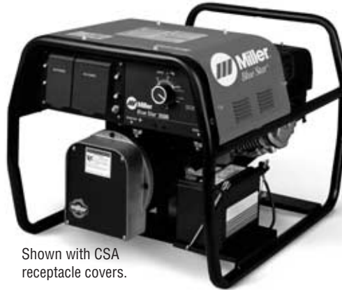
Shown with CSA receptacle covers.

The Blue Star® 3500 is a compact welding and power generator designed for applications where portability and versatility are essential. This unit is ideal for construction, maintenance and agriculture applications.