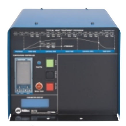
Control without recorder