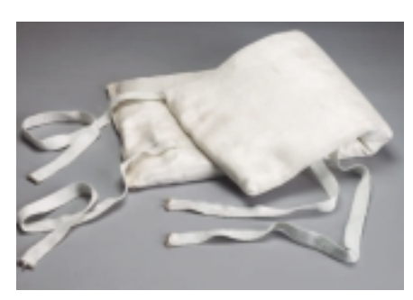
The insulation is designed for maximum temperature insulation, ease of use, durability and environmental friendliness.