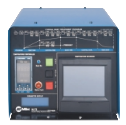
Control with digital recorder

The IHTS Controller provides for simple to advanced thermal cycle programs. The control comes programmed with a typical thermal cycle for stress relief. This includes a step in temperature from ambient to critical temperature, controlled temperature rise to the holding temperature, a soak or dwell at stress relief temperature, a controlled cooling rate to critical temperature and air cool (see chart). The programming of the unit is facilitated with a graphical presentation of the heat cycle and corresponding controller program. The IHTS is equipped with a large run, hold and stop button for ease of use. The control also includes the coolant flow switch. This switch insures that proper coolant flow is being provided to the liquid-cooled heating cable. A coolant fault is indicated with a light on the face of the control.